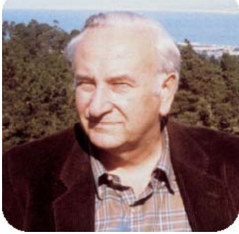
1980 – Vacation in Florida