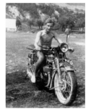
Author on a Scouting Camp in 1938