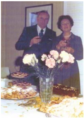
At a reception in 1971 (Toronto)