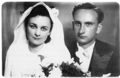
Wedding picture on 15 July 1944 Kielce, Poland