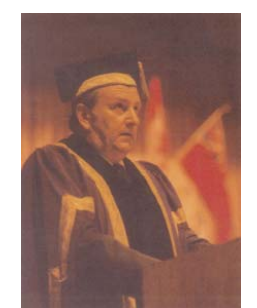
Author at a Graduation Convocation of Ryerson Polytechnic – 1975