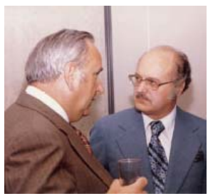
With Senator Stanley Haidasz (later first Canadian Minister of Multiculturalism) 1976