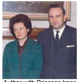
Author with Princess Irene (Montreal 1966)