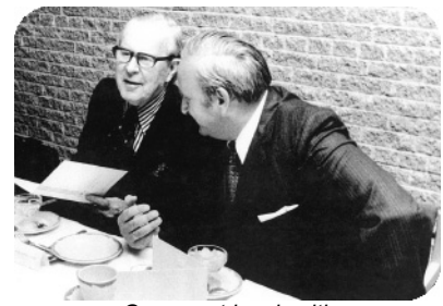
George at lunch with Rt. Hon. Lester B. Pearson, former Prime Minister of Canada, Oct. 1971