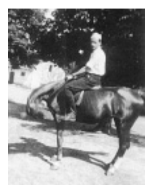
Author in Kotlice, Poland (1944)