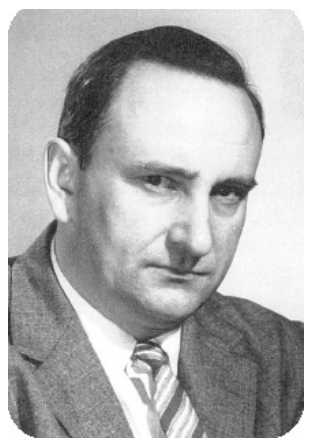
Author in 1976 as President of Ryerson Polytechnic, Toronto