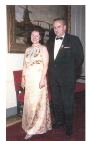
1966 – Author as President of Canadian Polish Congress receives, with his wife, guests at a Polish Ball on the occasion of 1000 years of Polish Christianity