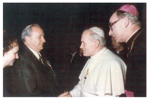
Exchanging books of poetry (in Polish) with the Pope who is an accomplished poet