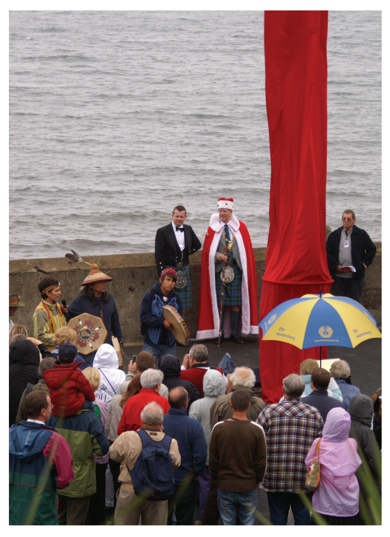
Preparations are complete and the rain drenched Raising and Unveiling Ceremony at 4 pm on August 18th 2006 is ready to begin with the Firth of Forth at full tide in the background.