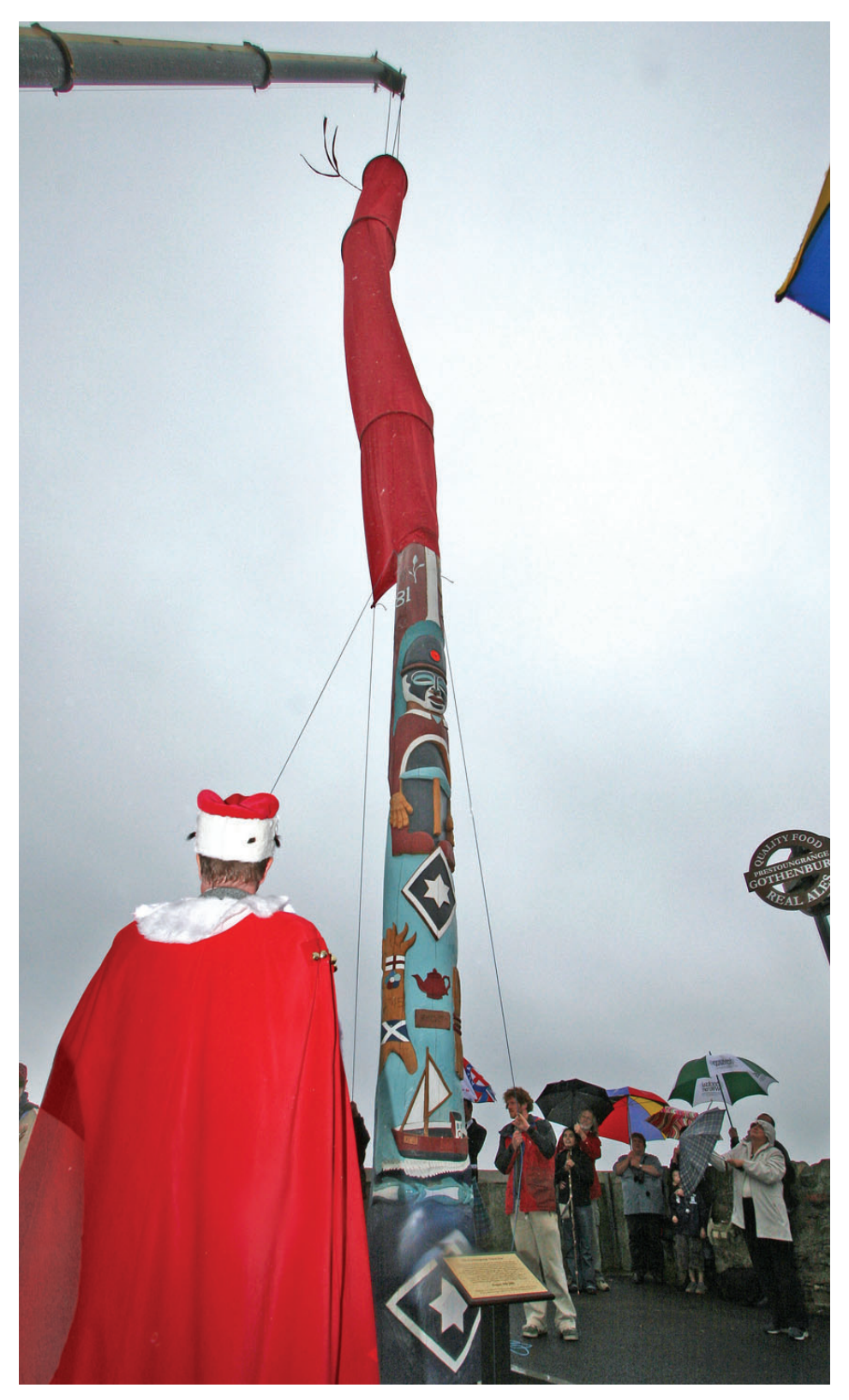
The totem story told aloud for the first time in Prestonpans and the red cloak that has been gradually raised as the story unfolded is finally lifted away.