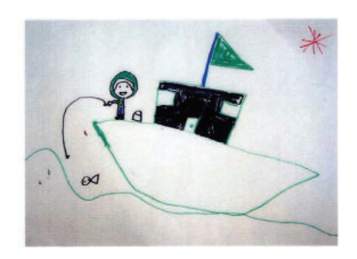
Children's designs above that were included on the pole by Lack Tun [below right] and Splash, seen here carving the Miner's Face shielded from the NE wind on the Prestoungrange Gothenburg car park.