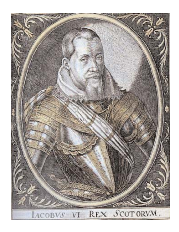
King James I & VI.