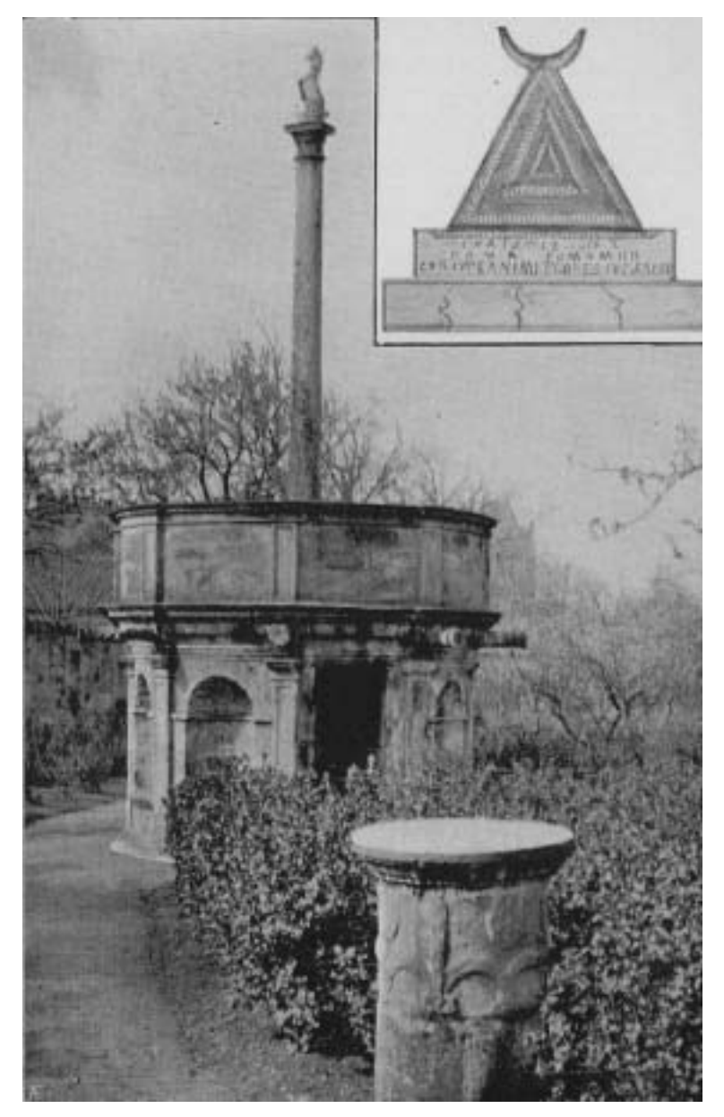
Figure 10: Preston Cross with an ancient pillar in the foreground; and also a contemporary drawing of the curious stone mentioned above.

From the 1st Edition of Peter McNeill's book of Prestonpans and Vicinity; 1884.