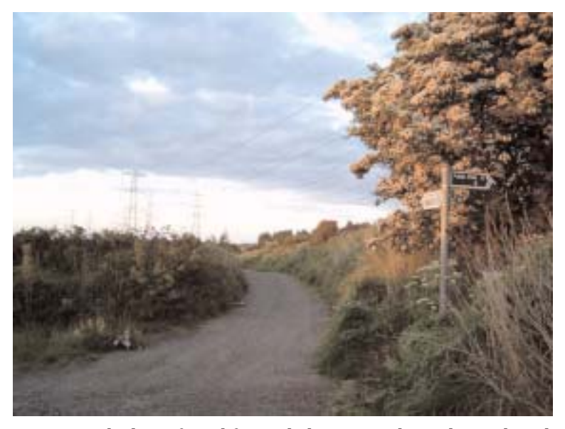
Figure 9: The line of road formerly known as the Kirk Road, and the Brickworks Road, leading from Johnnie Cope's Road.

During the intervening period, the people of Prestonpans attended the Old Kirk at Tranent. There is a road shown on John Adair's map linking the Tranent Church with the village of Preston, and this follows roughly the line of Johnnie Cope's Road but takes a more direct route diagonally to the south east across to the Church. Indeed, the direct line of the route was probably diverted onto the line of the route running today from the 'Roupin Steps' heading east to the Church. This track has been known as the 'Brickworks Road', owing to the presence of a brickworks along its length at one time, but before this it