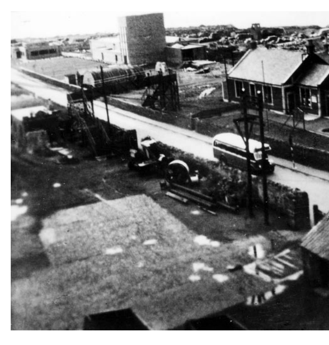
View of Prestongrange featuring NCB 'improvements' such as (from right) Road Transport, Bathhouse, Cafeteria East Lothian Council, David Spence Collection