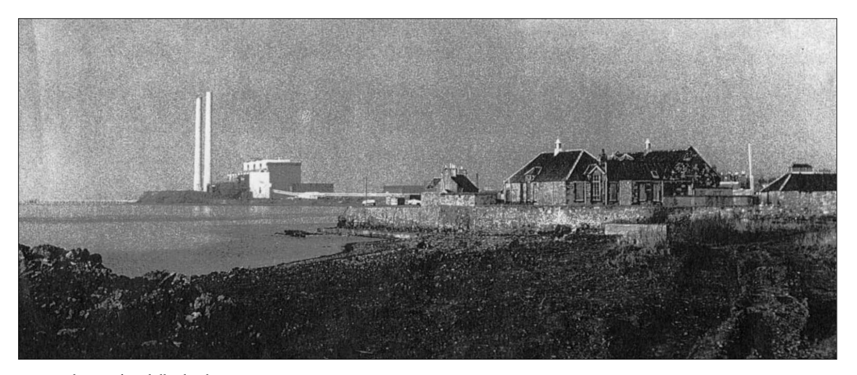
Eastward view of Cuthill School, Morison's Haven, Prestonpans