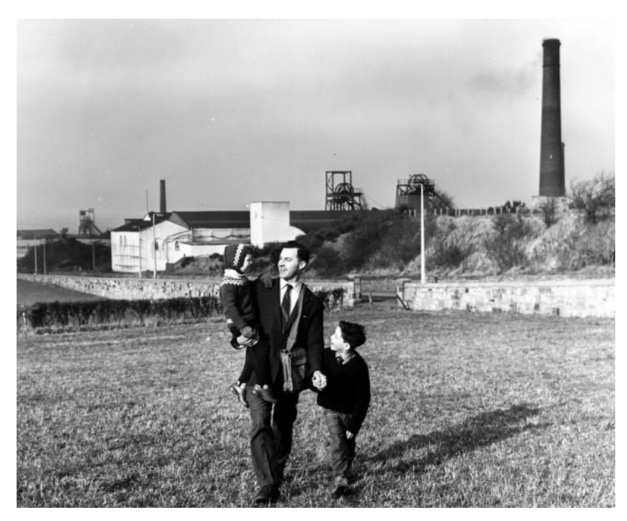
Miner returning homefrom work after using the 'new' NCB Bathhouse (c 1950)