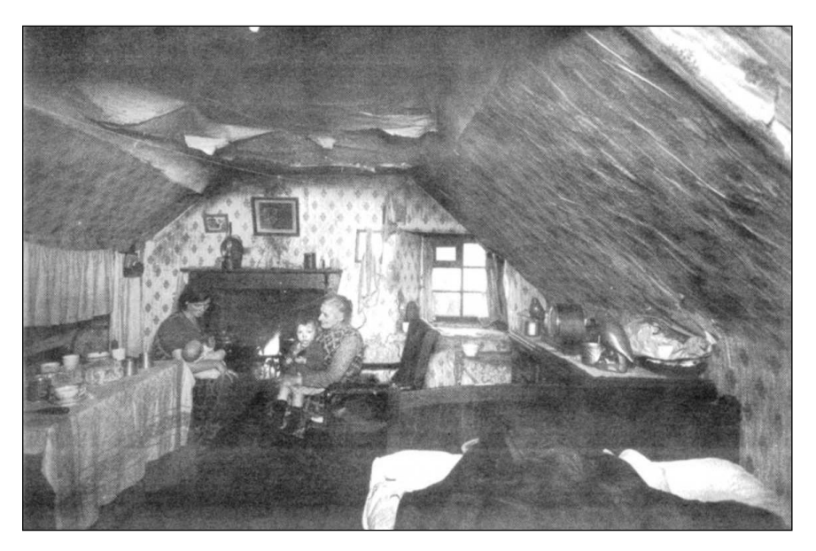
Example of the effects of neglect and lack of maintenance in early Miners' Housing