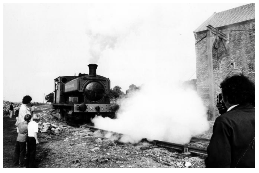
Prestongrange Steam Engine No. 7 entertains visitors at Prestongrange Museum