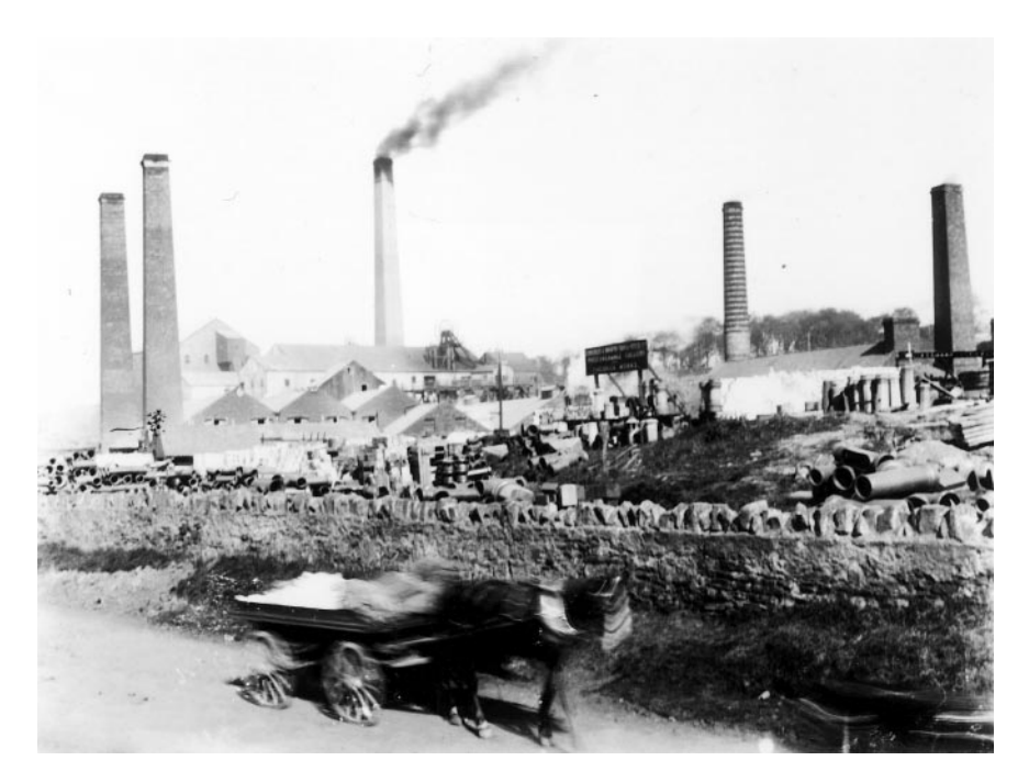
View of Prestongrange colliery with horse and gig in the forefront