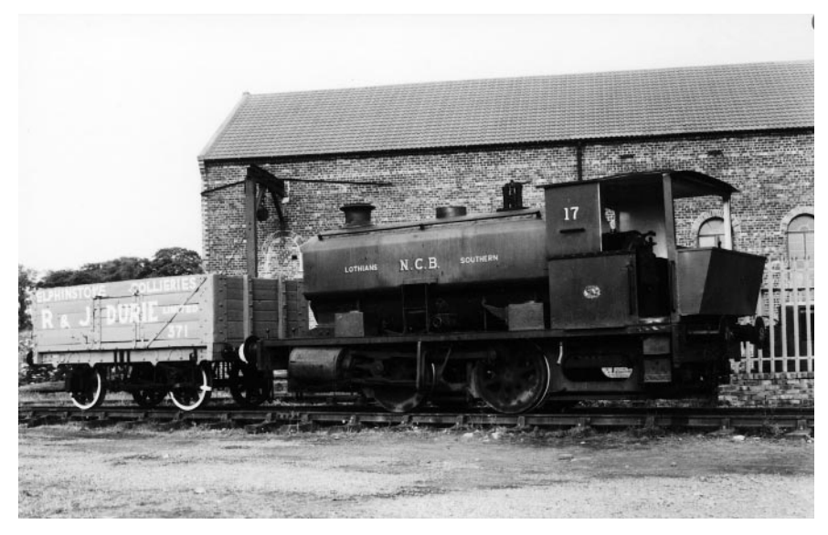
Lothians Southern Engine No. 17 at work at Prestongrange