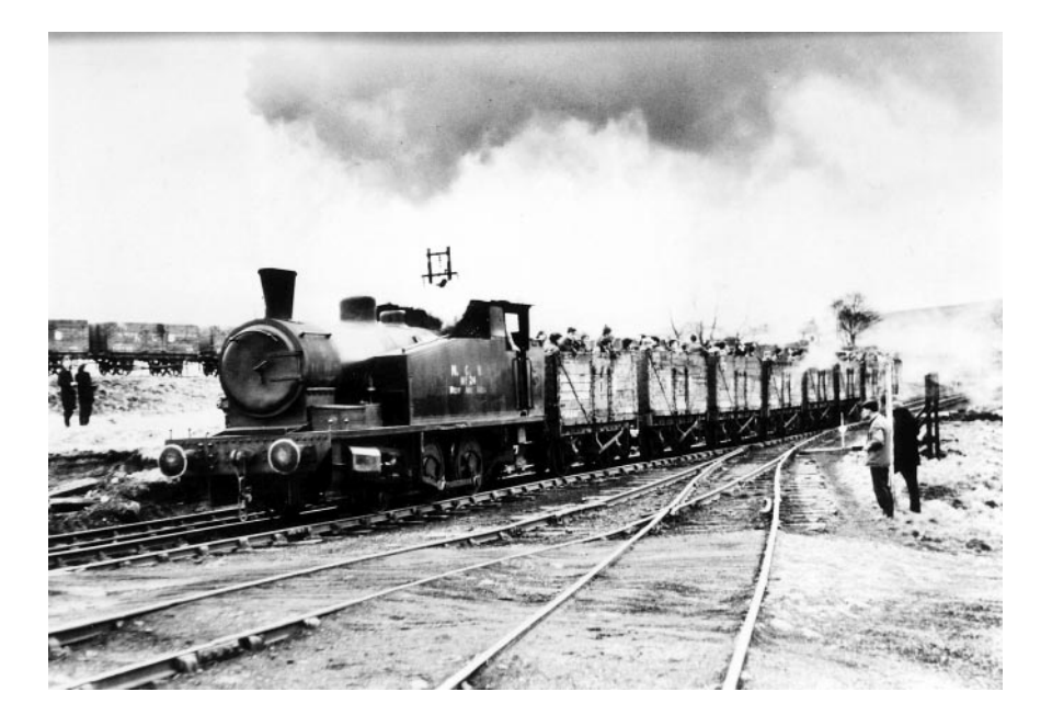
Coal trucks entertain the local miners' children