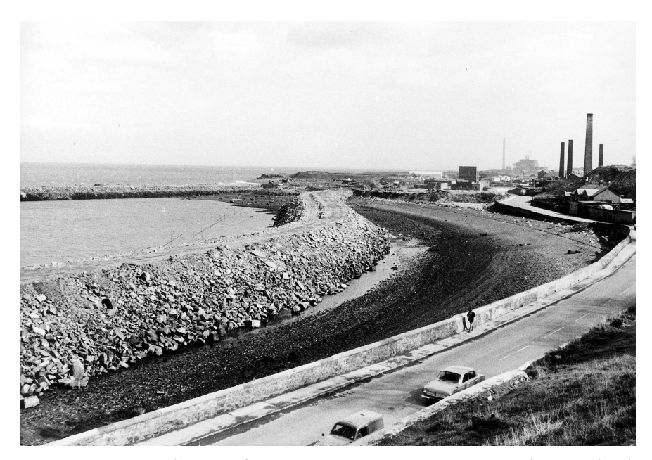
Figure 9 Eastward view of Morrison's Haven, Prestonpans showing land reclamation process

Due to the large scale of development at the Prestongrange site, many areas would have been covered with made surfaces preventing oil reaching the natural sub-soil. The lack of freshwater lakes or streams also means that there will have been little or no adverse effect to wildlife. Also, the nature of industry located there contributed contaminants far worse than oil dropped by railway vehicles.