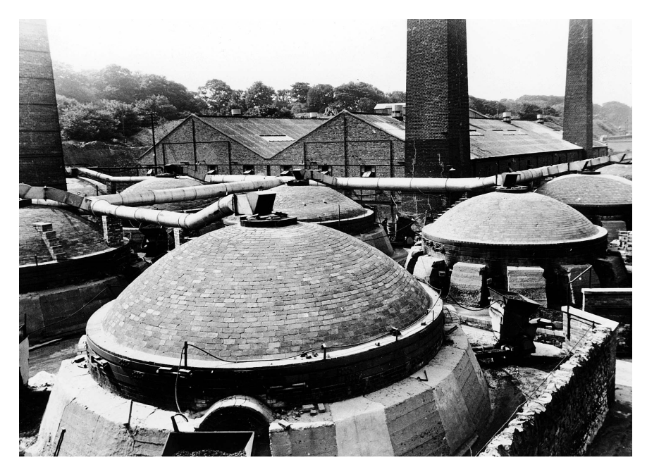
Figure 8 Beehive Kiln

The long history of the Prestongrange colliery site and Morrison's Haven means that there has been much activity on the site and the movement of the ground material means that any contaminants are more than likely untraceable back to one particular industry.