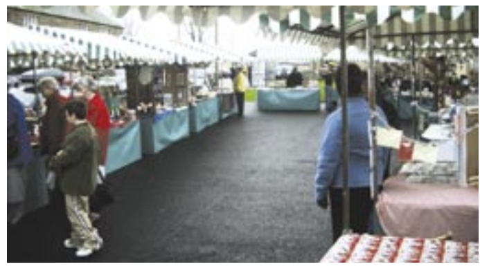
Christmas Market 2004

Many people visited the Goth for the first time as part of a Christmas party or office lunch, and many have since become regular customers. Our Christmas menus and party night dates will be available at the end of this month for Christmas bookings, book early as they say.