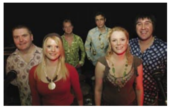
Local band - FUNKSTAR

The music programme has been particularly popular and the Goth is fast gaining a reputation as one of the best music venues in East Lothian.