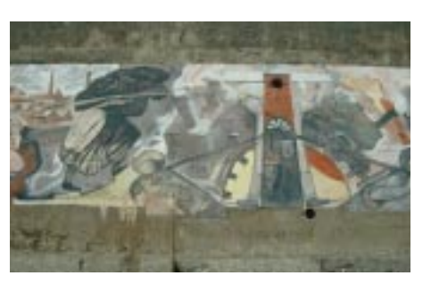
Painted October/December 2002 by Andrew Crummy, photography by Linda Sneddon (www.lindasneddon.co.uk)

2 brushstrokes / Spring 2003 www.prestoungrange.org