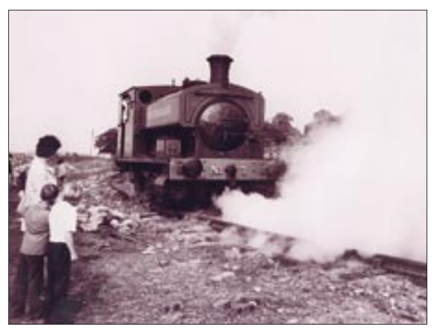
The Prestongrange Engine under steam

he Prestongrange Railway Society began life with the arrival of a steam locomotive from Lady Victoria Colliery at the site of the former Prestongrange Colliery, now the Prestongrange Industrial Heritage Museum. The Railway Society comprises people of all ages and backgrounds, who dedicate their free time to the steam and diesel engines that spent their working lives in the collieries and industrial sites of lowland Scotland, restoring them with a combination of hard work, determination, muck and sweat! The Society has searched out many engines in need of rescuing and restoration, especially those with historical links to the old Prestongrange Colliery and transported them to the Museum, working in all weathers, including, one occasion, a blizzard! Once on site, these engines were restored and repainted, ready to travel once again on track laid by Society members to provide rides for museum visitors during the summer months. This Society always welcomes new members and would be glad to hear from anyone interested in getting involved.