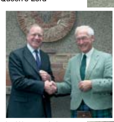
Lord Lieutenant declares The Goth open

Thirdly, with many friends he gathered pottery shards,