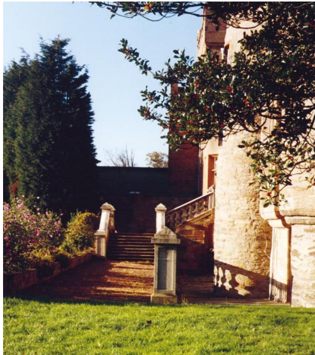
Staircase to South Entrance