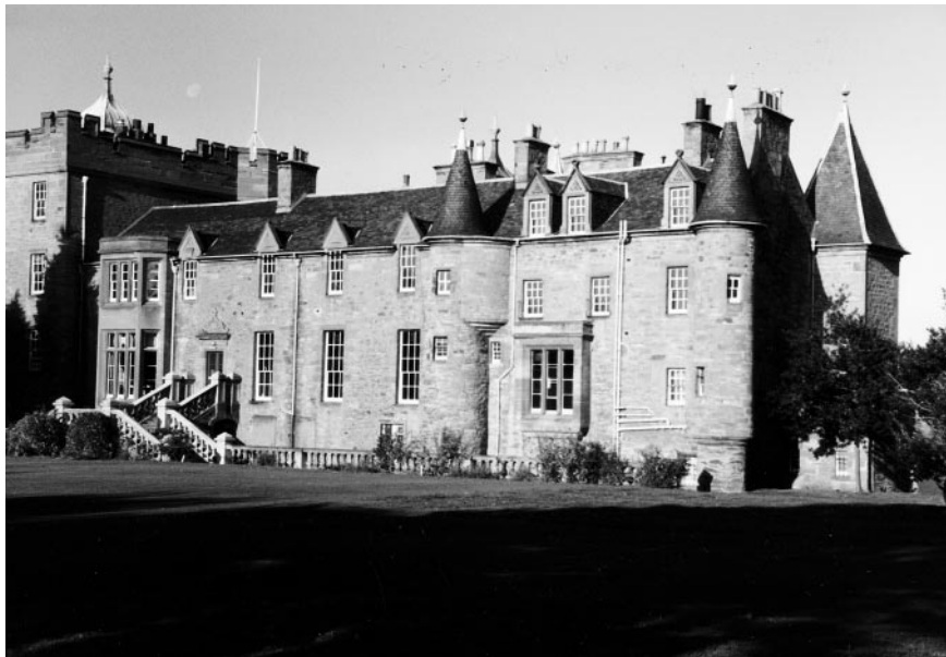
Rear view of Prestongrange House (now Royal Musselburgh Golf Clubhouse).

Such an extended history presents much of Scottish history in microcosm; it also is a lot to take in. Because of this, brief summaries of the relevant periods are provided, to enable the reader to place events that occur to and around the various owners, in a broader Scottish context. Until the eighteenth century, details are given of the monarchy, as several of Prestongrange's owners were closely aligned to the court. For the later periods, this type of information is of less import, as the aegis of power influence of the House's owners, like their contemporaries in both Scotland and Europe, was more closely tied to their immediate locality.