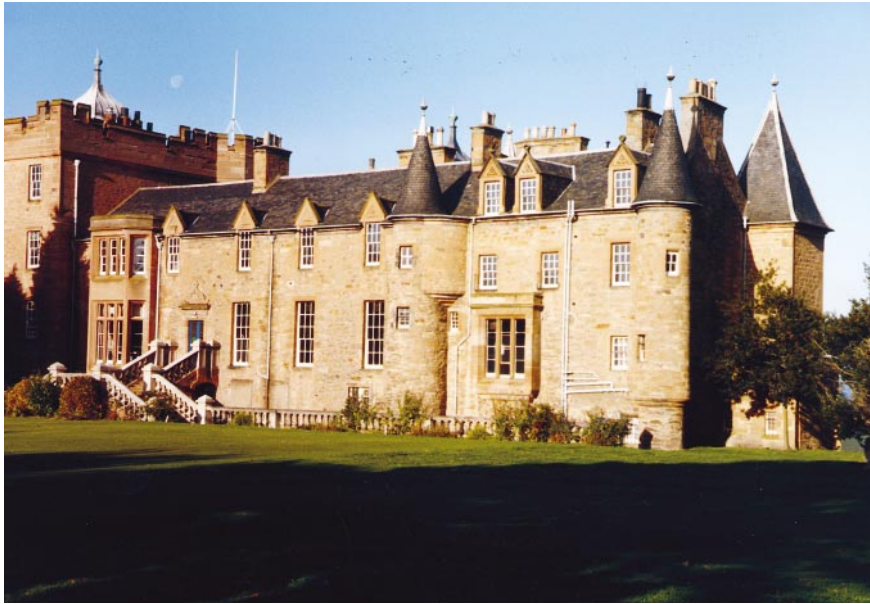
Rear view of Prestongrange House (Now Royal Musselburgh Golf Clubhouse).