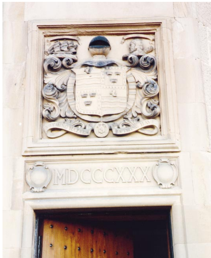
Coat of Arms above North Entrance