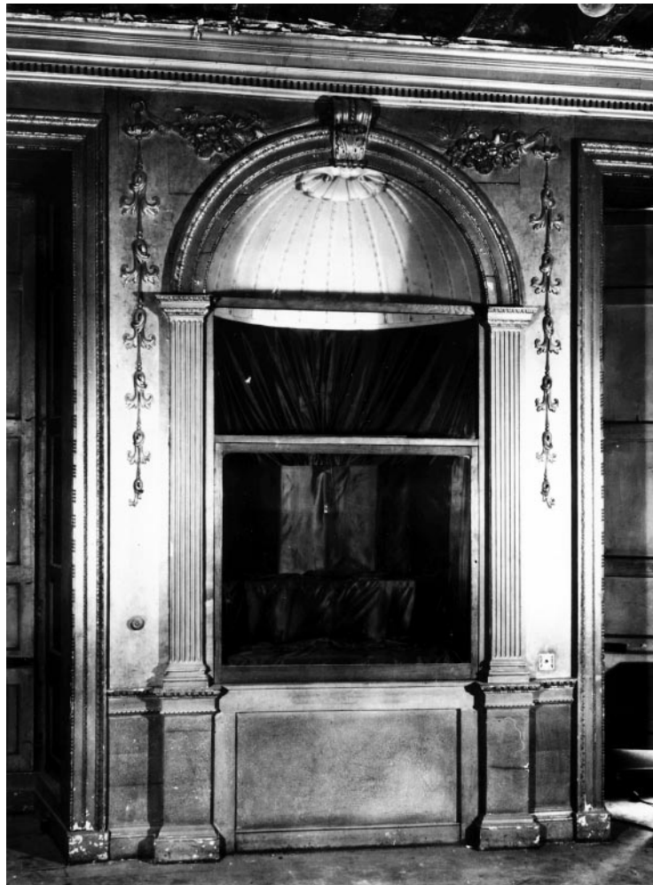
View of Alcove