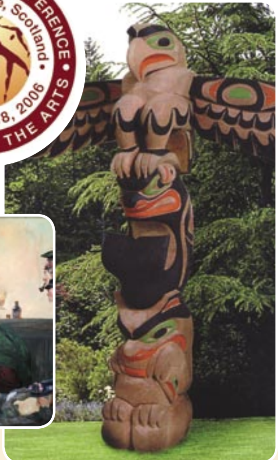
Right: A commemorative Canadian totem pole