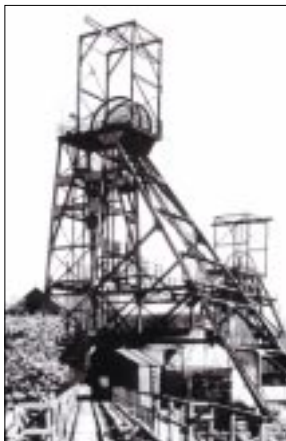
Winding Gear, Prestoungrange