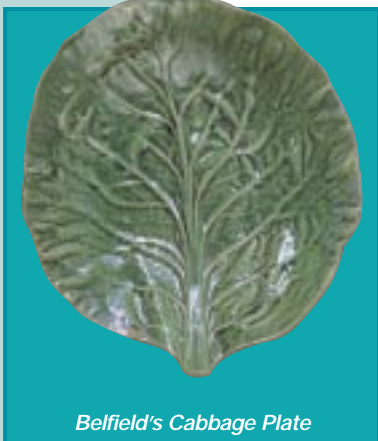
Belfield's Cabbage Plate