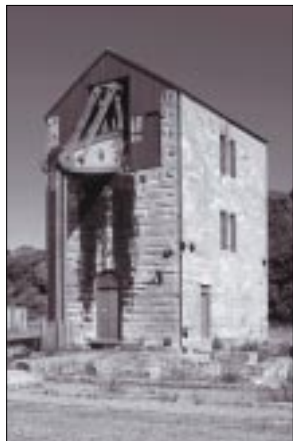
Beam Engine House, Prestoungrange