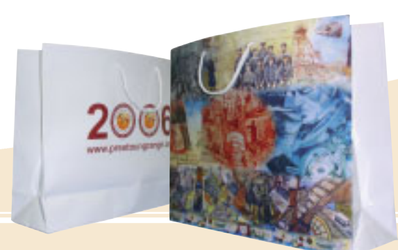
T08: Special Prestoungrange 2006 Gift Bag £1.00 Quantity