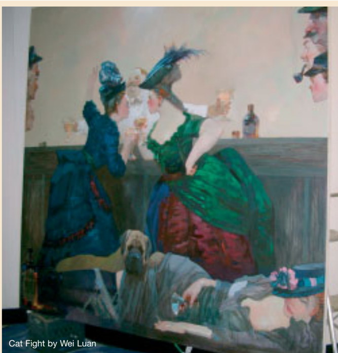
Cat Fight by Wei Luan

A real highlight was the involvement of ten distinguished local artists who each created an 8' x 8' mural in a single day. These murals were auctioned, and what 'we' thought the very best, entitled Cat Fight , by Wei Luan, is now on its way to Prestonpans.