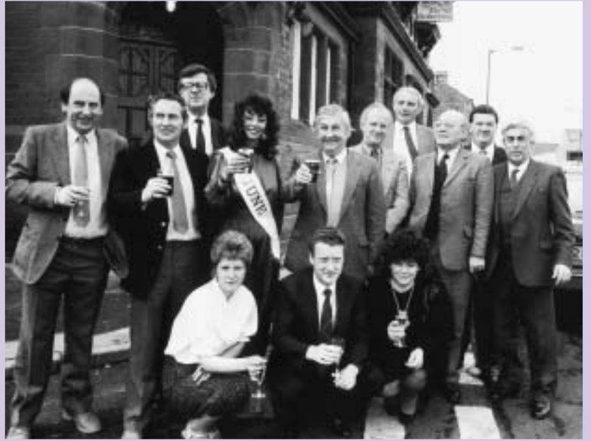
From the Edinburgh Evening News Nov 1986, celebrating the re-naming of the Gothenburg

More details of the Gothenburg opening will follow in the next Brushstrokes, or keep an eye on the website.